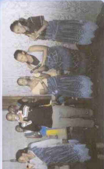
Paragraphs below shows some of international students registered at the University of Nairobi 2011/2012 during the international student day in 2011.

International students facilitates international students' admission according to regulations.